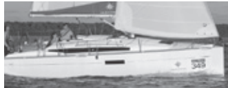
Sun Odyssey 349