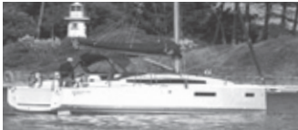
Sun Odyssey 380

Jeanneau's fast and fun power & sailboats offer the perfect way to enjoy the water. Supplies are currently very limited, so order now to secure 2022 delivery.