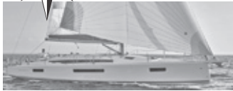
Sun Odyssey 410