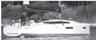
Sun Odyssey 380

Jeanneau's fast and fun power & sailboats offer the perfect way to enjoy the water. Supplies are currently very limited, so order now to secure 2023 delivery.