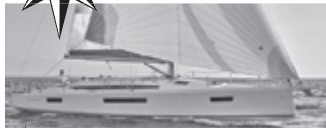
Sun Odyssey 410