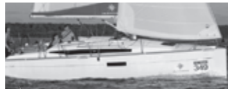
Sun Odyssey 349