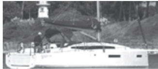
Sun Odyssey 380

Jeanneau's fast and fun power & sailboats offer the perfect way to enjoy the water. Supplies are currently very limited, so order now to secure 2023 delivery.