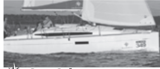
Sun Odyssey 349