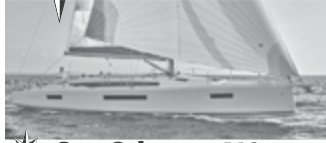
Sun Odyssey 410