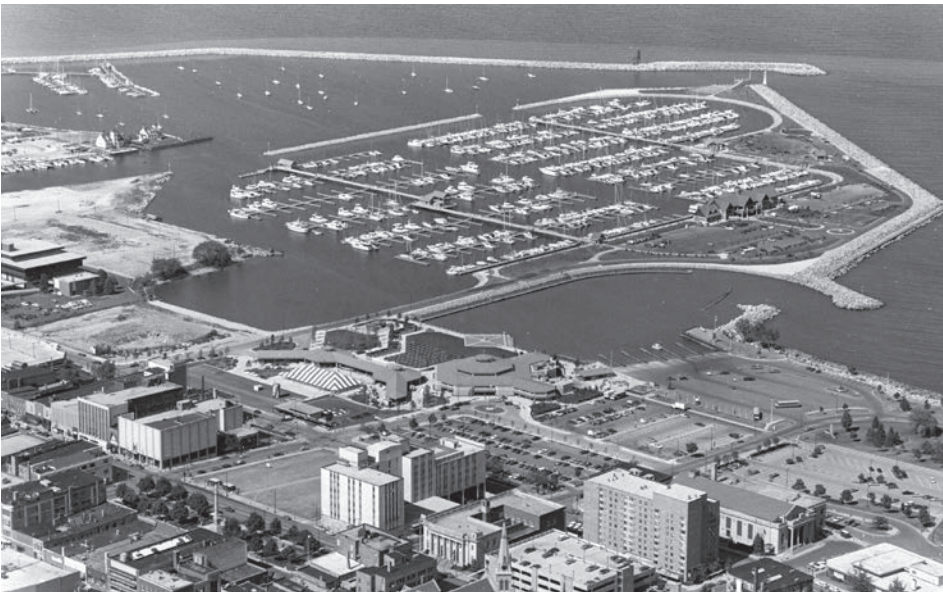
The harbor as it stands today. The surface area is much smaller than it used to be and surge from storms is greatly reduced. Note that there has been significant development in the downtown area since this photo was taken.

A pair of docks, partially floating, which accommodate boats that have been launched have been installed just south of the new crane location. A public dock further south has also been added (this by the city) near the Rooney Recreation Area; it is just east of the old Walker site and accommodates fishermen and occasional boaters needing a place to tie up temporarily.