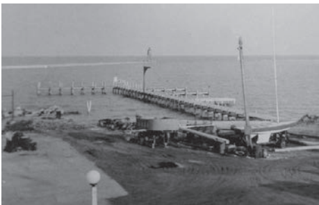
The Wadewitz pier as finished. Spring, 1956