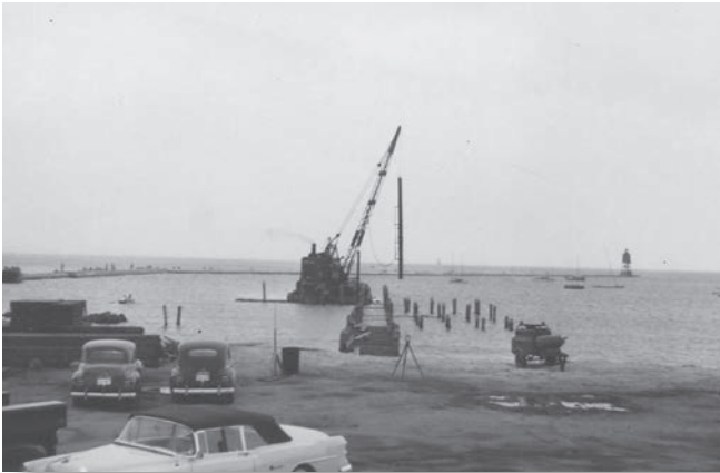
Driving wood pilings. 1955