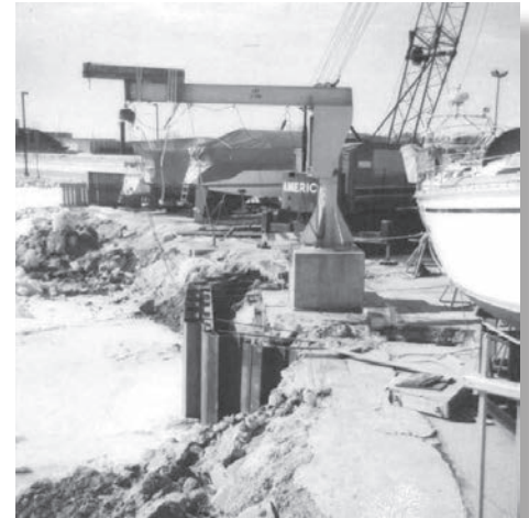
Building the mount for the Star crane in 2011.

This problem has been somewhat reduced by the addition of “Ice Eaters”, submerged 220V, ¾ HP motors spinning 10 inch propellers at about 875 RPM. This keeps the water moving and reduces the formation of ice on the pilings. Changes in water levels also require work: fingers have to be moved up or down if the changes are significant.