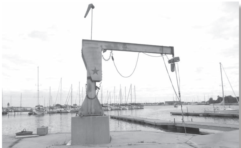
The crane today. There are now no launching facilities on the pier.

The construction of the pier extension was not the only improvement to our facilities. In 2001 Star boat sailors banded together and created a new, permanent mount for the launching crane which was moved from the Wadewitz pier. This involved placing a seawall of steel sheeting and building a concrete base on the shoreline.