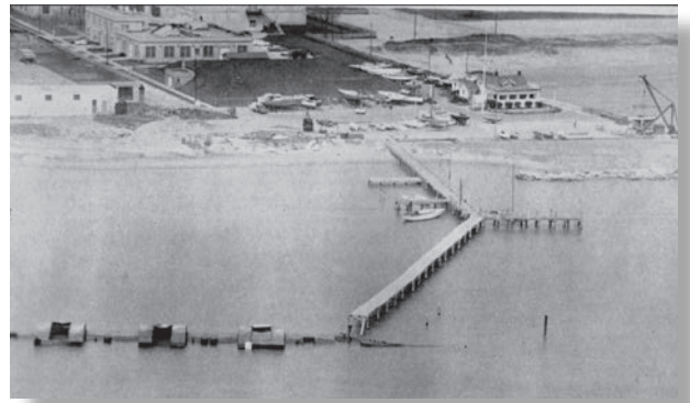
Construction of the pier extension is in progress.

As can be seen from the photo the barges still had their deckhouses in place and when, one morning, people began to arrive at the Club they were greeted by a sign someone had painted