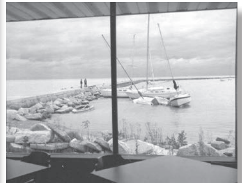
Part of the aftermath of an October, 1977 storm. Damage like this is much less likely now.

Storm damage to boats, which was so much of a problem for so many years has been largely eliminated; the construction of the marina and the landfill to the south has made the surface area of the harbor smaller and storms, particularly from the southeast have much less water to work on. There are also many fewer boats moored out in the harbor so the chances of them breaking loose and careening through the fleet as happened in the October, 1977 storm, shown below, are much, much smaller.