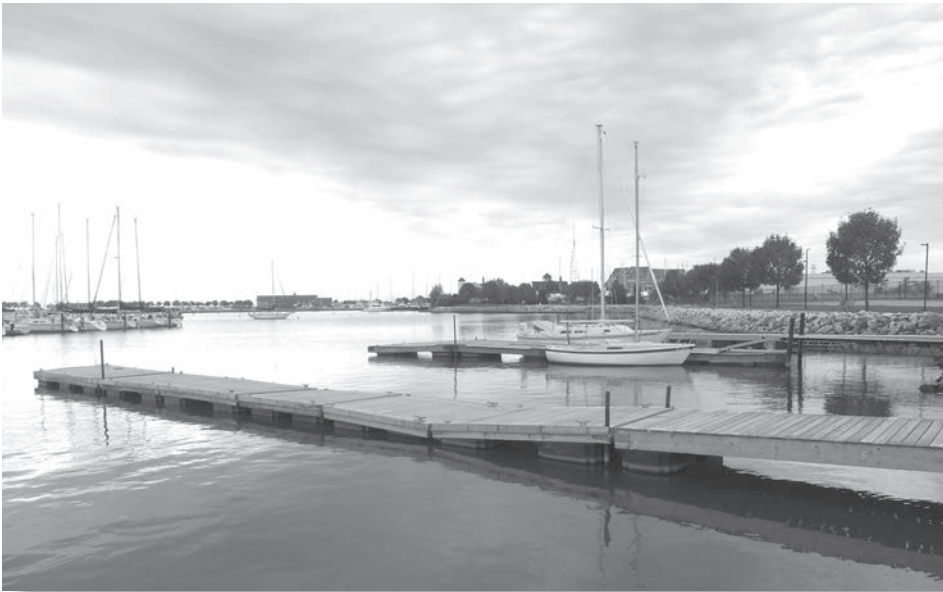
The floating docks next to the Star crane.